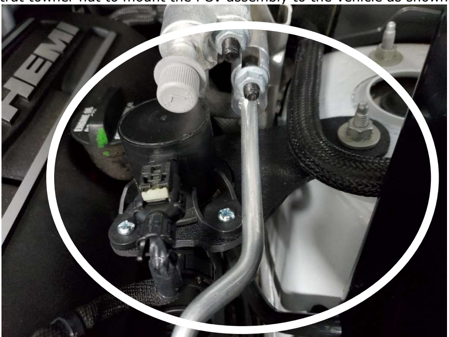
TIP : The PCV line twists at both ends. Twist and connect to the PCV connection on the solenoid from the valve cover

8 Use the front strut towner nut to mount the PCV assembly to the vehicle as shown.