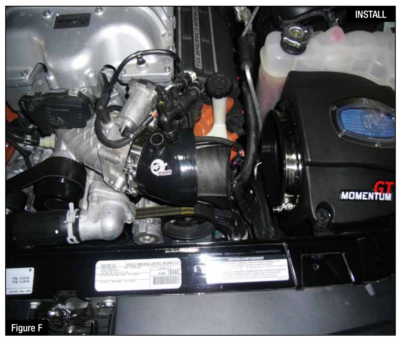
Refer to Figure F for Step 13

Step 13: Install the coupling over the throttle body with the clamp. Do not tighten yet. Make sure it's oriented correctly.