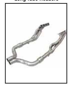
P/N: 48-32014-YC (Street) 48-32014-YN (Race)