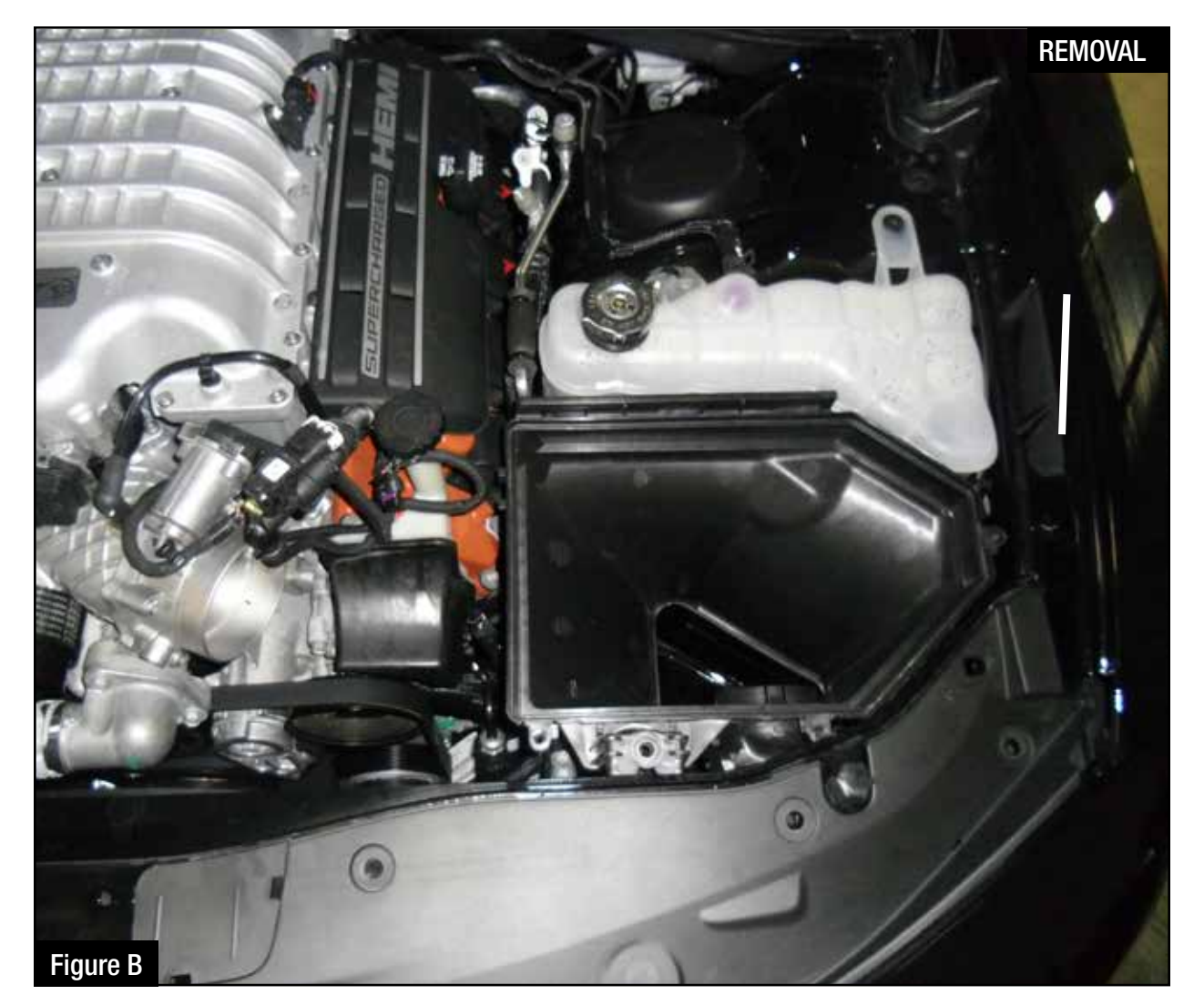
Refer to Figure B for Step 5

Step 5: For Charger, open the housing and remove the factory filter. Then disconnect the inlet duct and pull the bottom part of the housing outside of the vehicle. (The inlet duct is not removable)