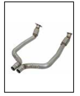
P/N: 48-32015-YC (Street) 48-32015-YN (Race)